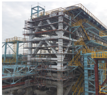
石油化工廠等的防火被覆（鋼柱，鋼樑等） / Fireproof cladding (steel column and steel beam, etc.) in petrochemical plant