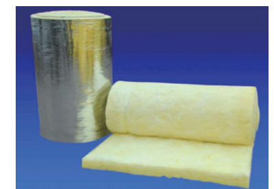
符合最新版 IMO 降噪規則的不燃保溫材料 / Noncombustible thermal insulation material which complies with the latest IMO noise reduction regulation