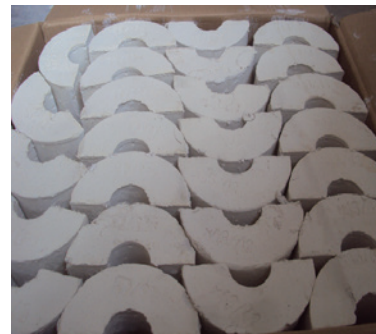
高性能矽酸鈣保溫材料 / High-performance calcium silicate thermal insulation material