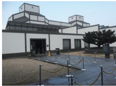
用於博物館和美術館的防火調濕建材（牆體和天花等） / Fireproof humidity controlling materials for museum and galleries (wall, ceiling)

■ 防火被覆裝飾建材：用於鋼柱，鋼樑，牆體，隔震系統，穿孔部位的火焰隔斷以及建築物內外部的裝飾等