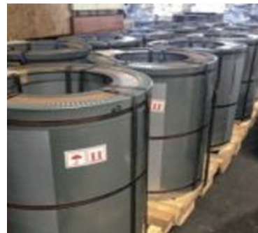
石油化工廠外部保溫管廊，保溫材料等的外裝用金屬保護板 / Metal jacket for protecting exterior pipeline and thermal insulation material in petrochemical plant