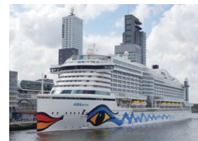
最新郵輪業務業績 / The latest cruise ship which include materials we supplied

◎ Others (including IMO certified products): Furniture, fabric, wallpaper, PVC sheet, toilet booth, fire retardant door and window, stone for interior and exterior use, decorative glass, decorative hardware, LED lighting, LED electro-optical art performance system, cabin accessories, etc