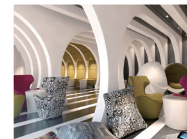
內裝材料 / Interior decorative materials